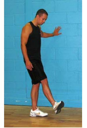
Lower Leg Mobility